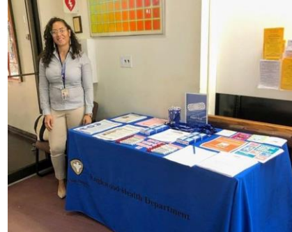
Health Educator tabling during the Adult Flu Clinic at the Englewood Public Library

"Englewood Health Watch," our quarterly newsletter, is printed for distribution throughout the community and posted on the city website. The seasonal newsletter is written based on National Health Observances, upcoming programs and successful programs. The Health Educator contributes articles to the newsletter which helps to educate the public on health topics and where to seek information.