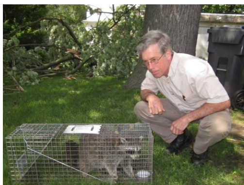
Public Health Investigator trapping raccoon

Additional efforts to prevent the spread of rabies includes investigation of all bite reports, issuing confinements of domestic pets involved in bites and quarantines of