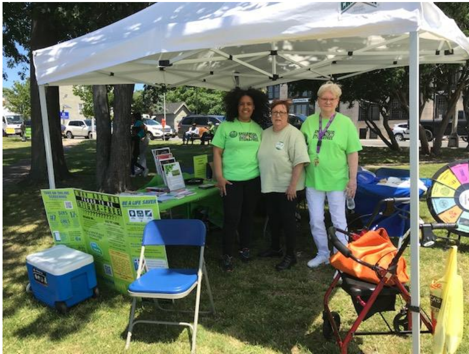
Stigma Free Englewood provides community outreach during Juneteenth celebration