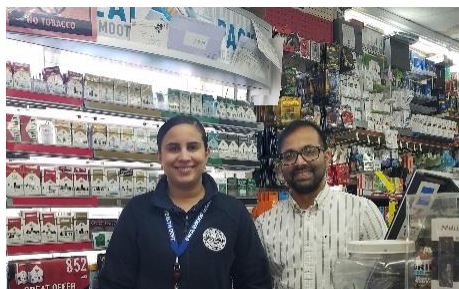
Senior REHS during the TASE program

Tobacco Age of Sell Enforcement (TASE) and Electronic Smoking Device (ESD) inspection are conducted at licensed retail establishments in the City of Englewood to determine compliance with the New Jersey Department of Health regulation, N.J.S.A. 2A:170-51.4 which States: "The sale of a tobacco and/or any type of smoking device to someone under the age of 21 is prohibited." The REHS team work with a young adult under the age of 21 to investigate the establishments. In April 2019, the REHS team conducted 10 inspections for the TASE program and all 10 retail establishments passed. In October and November 2019, the REHS