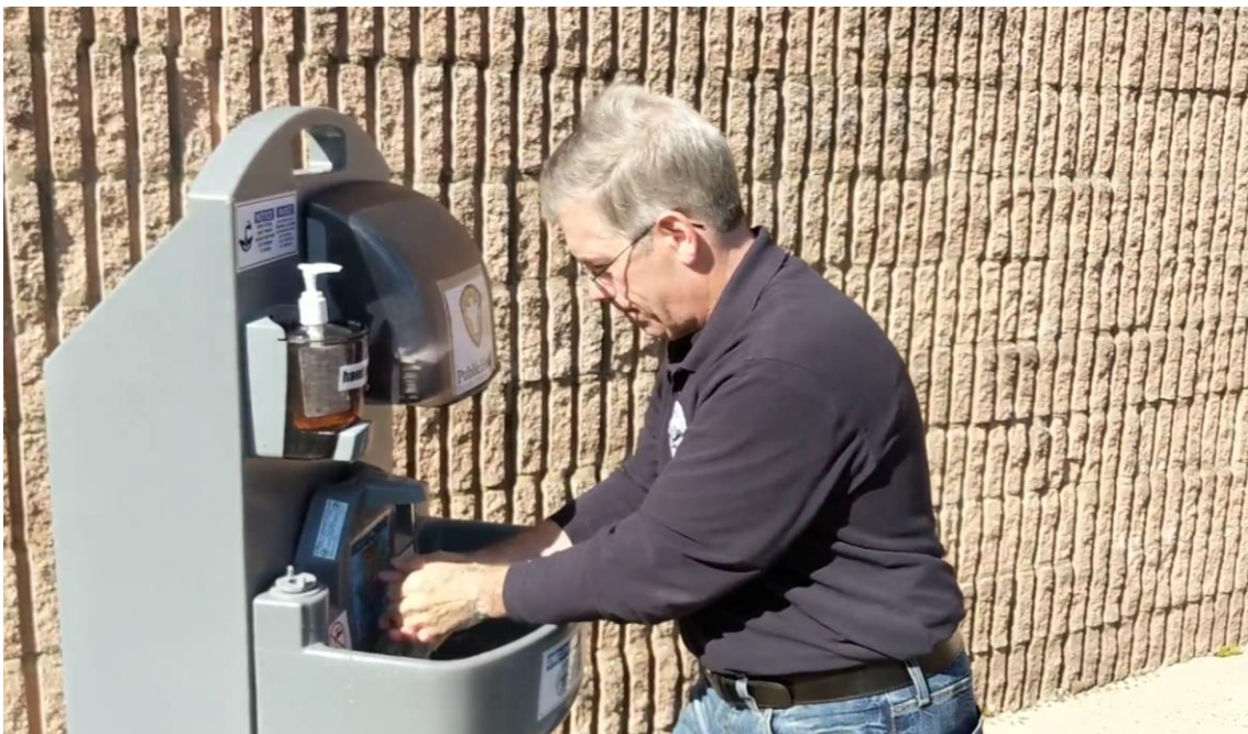
Public Health Investigator demonstrating proper handwashing at a portable sink

Plan reviews cover businesses such as retail food establishment's beauty, barber, nail salons and Public Recreational Bathing Facilities.