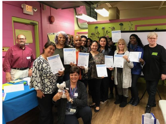
Mental Health First Aid training at Bridges Bergen Family Center