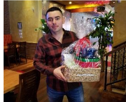
Prize winner at the Food Safety Council meeting

In 2015, a Food Safety Council was formed in order to establish a collaborated effort in maintaining Safe Food Handling practices within the City of Englewood. The council works along with Health Department Director and REHS team to offer Best Practices, Training, and Networking opportunity to local food establishments.