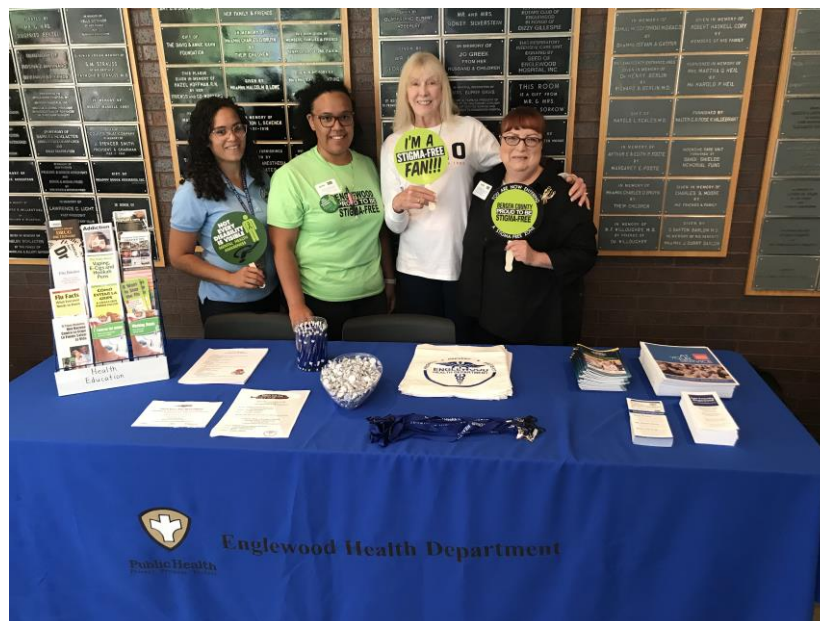
The Health Department and Stigma-Free tabling at the Chamber of Commerce Well Fair