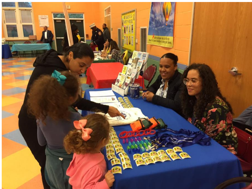
Annual Latino Festival at Dr. John Grieco Elementary School

The Health Educator participates in a variety of health-related community events throughout the year to promote the department's services to residents and create partnerships with local businesses and centers. The health education unit continuously reaches out to schools, community center, churches, seniors and the general public to provide health education and activities.