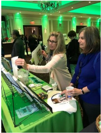
Bergen County Stigma-Free Symposium