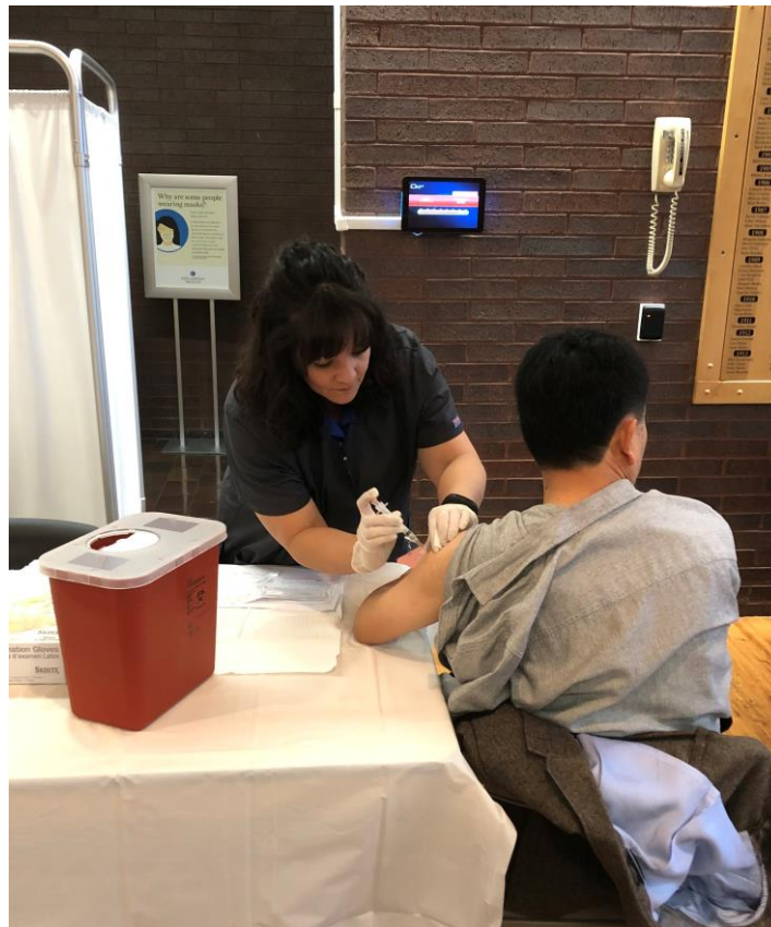
Flu Clinic during an event sponsored by the Korean Community Center

The Public Health Nurse provided onsite training to Englewood Health Department staff on safe vaccine management and handling.