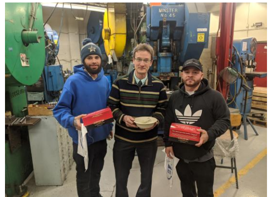
Health Director handing out lunches to Great American Smokeout participants