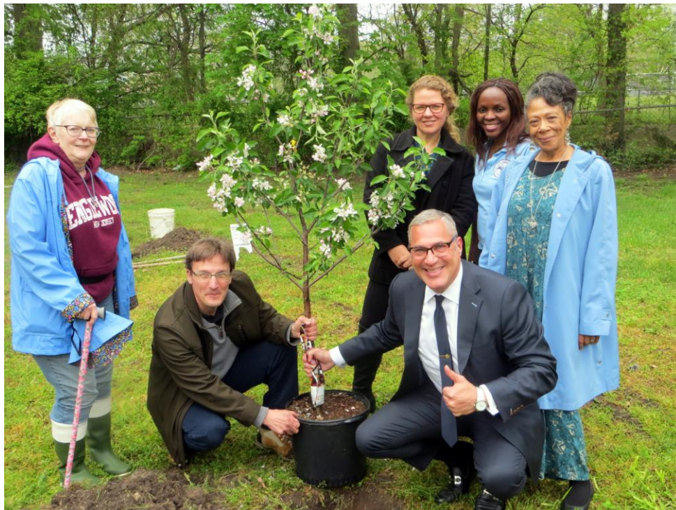
Tree planting on Arbor Day at the community garden