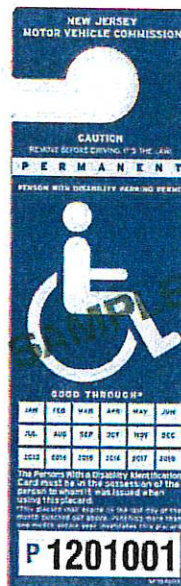
FIGURE 2: Permanent Person with a Disability Placard