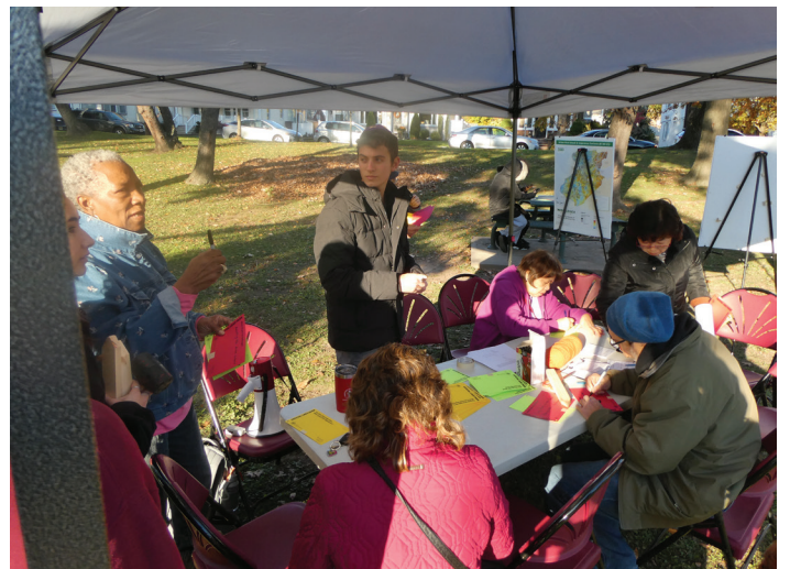
Workshop at Crystal Lake Park

Notecards placed by residents were geo-located