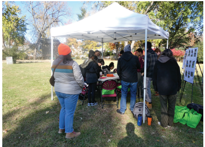
Workshop at Morris Park

CUES team members assisted participants to place the card at the location that the comment referred to and mapped the placed card.