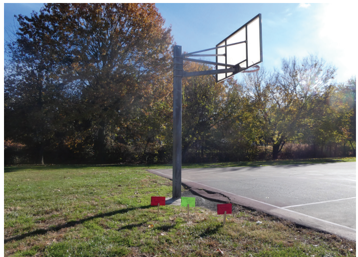
Notecards at basketball court